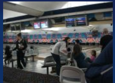
Resident Mystery Event- Bowling