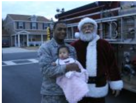
Santa rode on the firetruck to visit our residents.