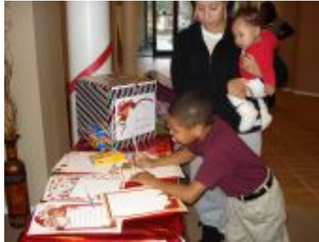
Residents writing letters to Santa.

January is International Creativity Month.