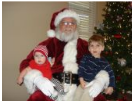
Santa made a special stop on his way back to the North Pole to take pictures with our residents.