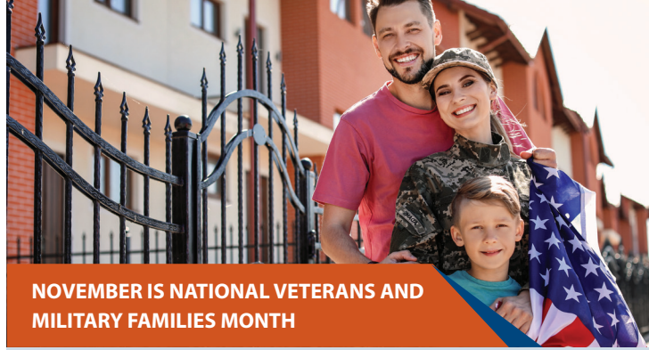
NOVEMBER IS NATIONAL VETERANS AND MILITARY FAMILIES MONTH

On November 21st from 3:00 to 4:00 PM, come to the Main Base Housing Office and make a Thanksgiving craft with our office staff.