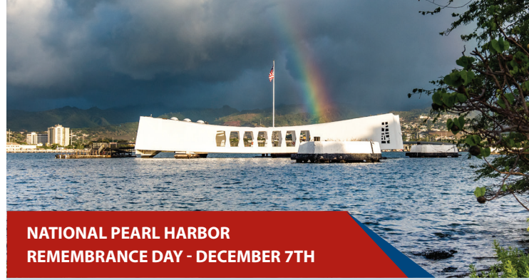
NATIONAL PEARL HARBOR REMEMBRANCE DAY - DECEMBER 7TH

On December 23rd from 3:00 - 4:00 PM, stop by the Main Base Housing Office to decorate sugar cones like Christmas trees using frosting, M&M's, gumdrops, etc.